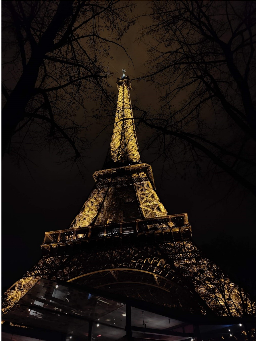
La vie en rose Photograph of Eiffel tower, Paris