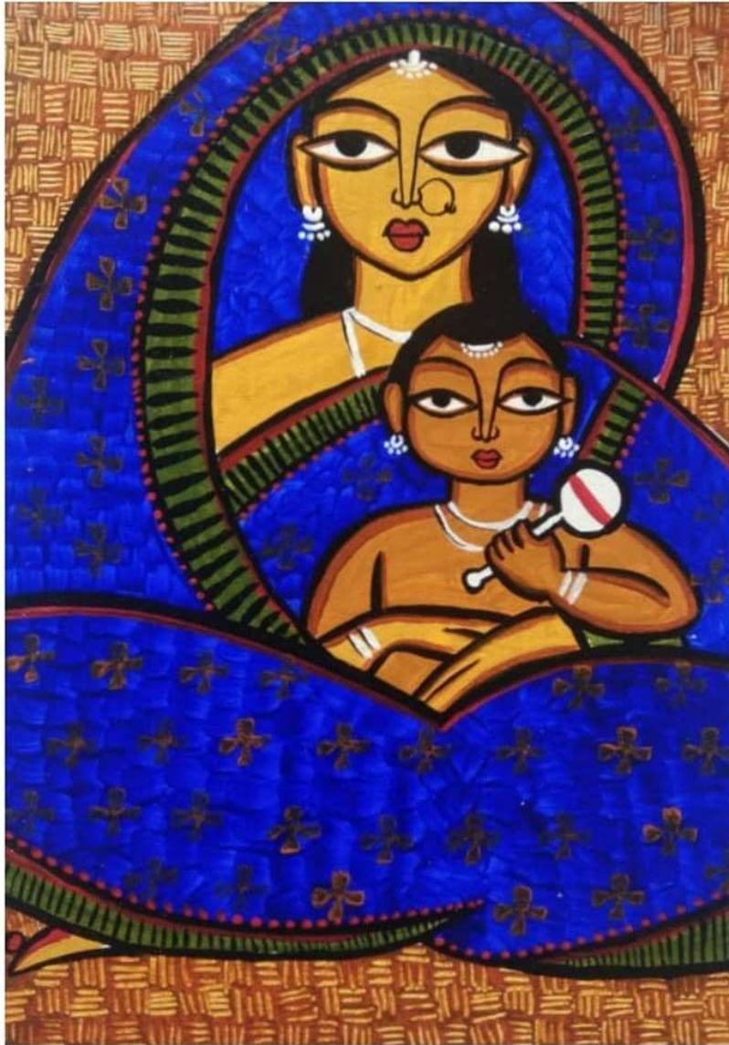
'Mother and child' painting inspired by Jamini Roy.