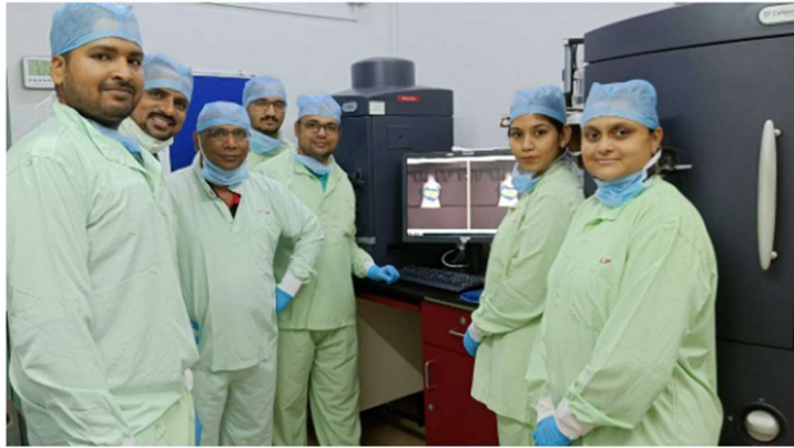
The study published recently in the journal Translational Oncology has recommended using NSG over conventional technologies.